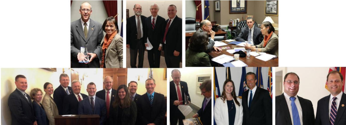
Photos of members of the agricultural and applied economic community and Members of Congress (2013-2015).