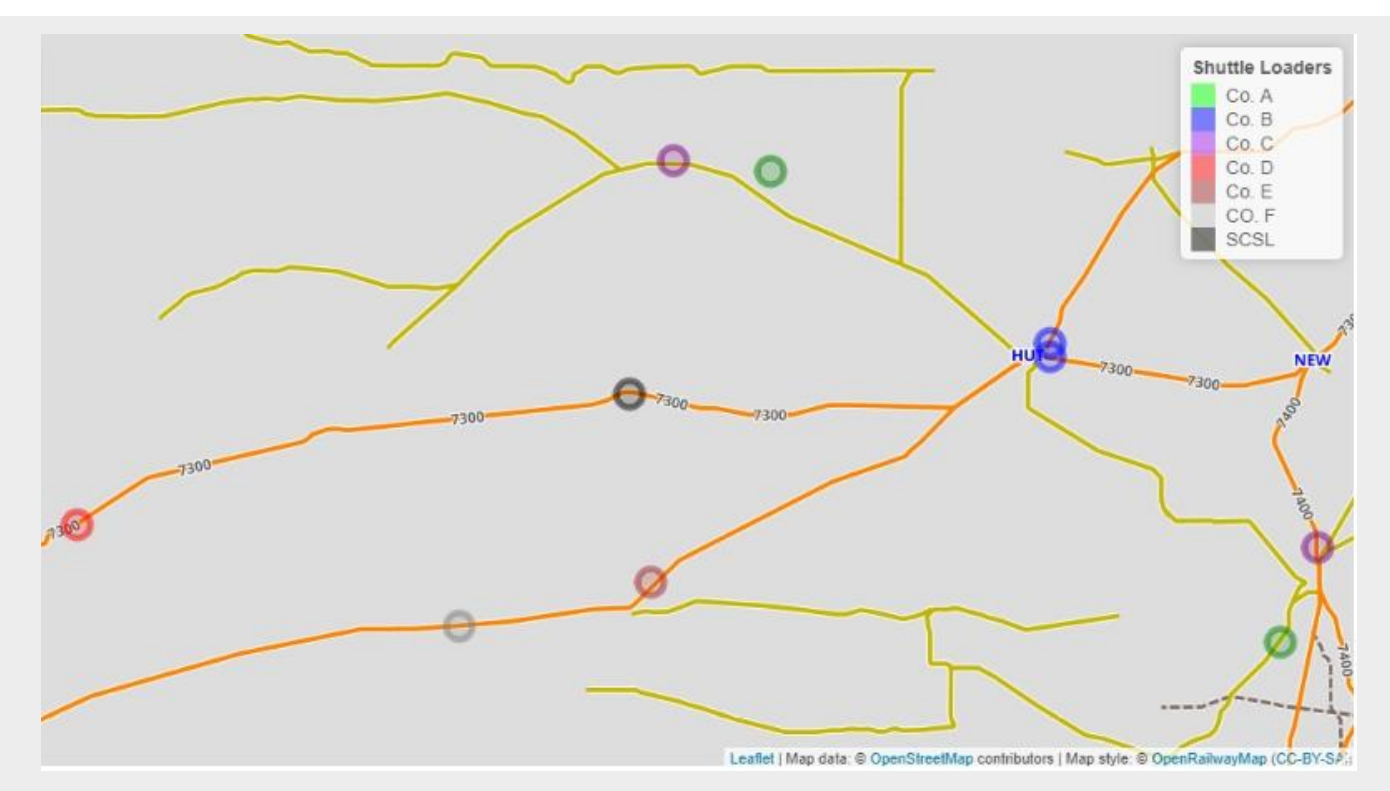
Map 1. Grain Shuttle Loaders in South-Central Kansas

Note: Constructed on the basis of data compiled from Arthur Capper Cooperative Center Interactive Maps.