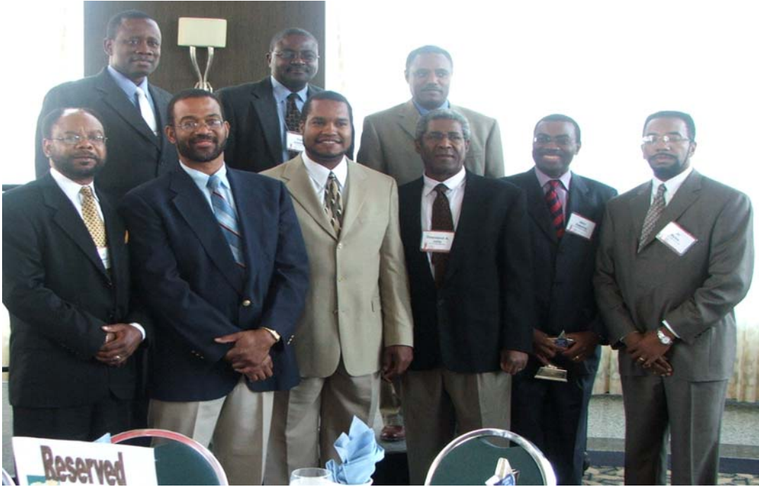
Outstanding Black Agricultural Economist honorees (l to r, front row), Donald McDowell (NCA&T), Edmund Tavernier (Rutgers), Dave Weatherspoon (Michigan State), Desmond Jolly (Univ. of CA), Akin Adesina (The Rockefeller Foundation), Albert Allen (Mississippi State U.). Back row (l to r), William Amponsah, (NCA&T), Adelija Adesolji (Michigan State U.), Abebayehu Tegene (USDA-Economic Research Service), Curtis Jolly (Auburn University, not present)

~~~~~ How can we keep the fire burning and hold the attention of our members and constituents? Simply put, we must continue to address important issues and become stronger advocates for diversity and unity. COSBAE has a lot to offer. We are hosting an organized symposium at the Southern Agricultural Economics Association and the Rural Sociological Association conference in Orlando, Florida and will participate in the AAEA conference in Long Beach, California. During the interim, we are considering an outreach program for the spring or early summer of 2006. Plans for this event are in the preliminary stages, however, we will keep you posted on its progress.