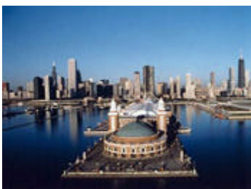
Some attendees found time to enjoy exploring Chicago. Pictured is the Navy Pier.