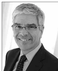
Paul Romer , New York University

Paul Romer, an economist and policy entrepreneur, is a University Professor at NYU and director of the Marron Institute of Urban Management. Marron deepens the fundamental understanding of cities by working with civic innovators to improve urban management. He is also the founding director of the Urbanization Project at the Leonard N. Stern School of Business. The Urbanization Project conducts applied research on the many ways in which policymakers in the developing world can use the rapid growth of cities to create economic opportunity and undertake systemic social reform.