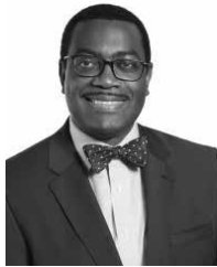
Akinwumi Ayodeji Adesina , African Development Bank

Dr. Akinwumi Ayodeji Adesina is the President of the African Development Bank Group, having been elected to the position in 2015. He was awarded the 2017 World Food Prize, cited for driving change in African agriculture for over 25 years and improving food security for millions across the continent. In the same year he was the recipient of the Gene White Lifetime Achievement Award for Child Nutrition.